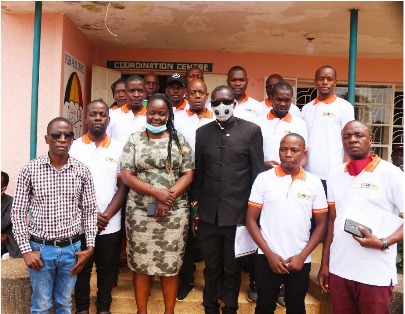
C: Meeting the Banner Writers Association Members