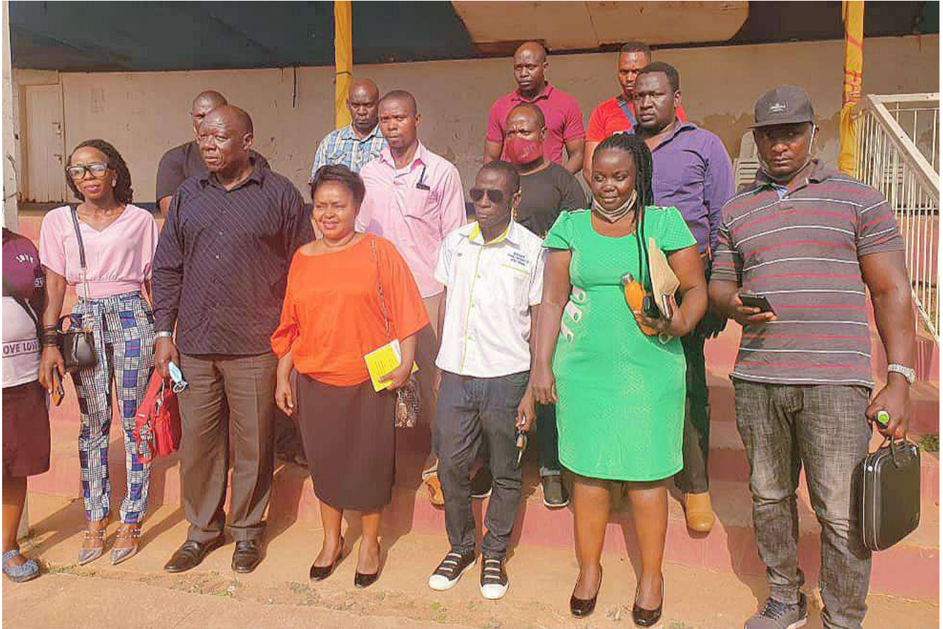
B: Meeting The Bouncers